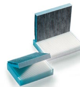
Laser-sintered manufacturing aid for assembling automotive air intake filters.