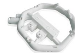
Laser-sintered complex part for the aerospace industry.

With laser-sintering you can implement new business models in numerous industries. Imagine a kind of mini factory, located close to the customer, where he designs his individual product. Or take a laser-sintering system to the Formula 1 race track and optimize critical parts during the race.