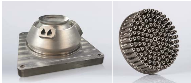
The additively manufactured injector head as all-in-one design (AiO) of a rocket engine with 122 injection elements is made from EOS NickelAlloy IN718. (left) The functional component of the all-in-one design: the baseplate. (right)