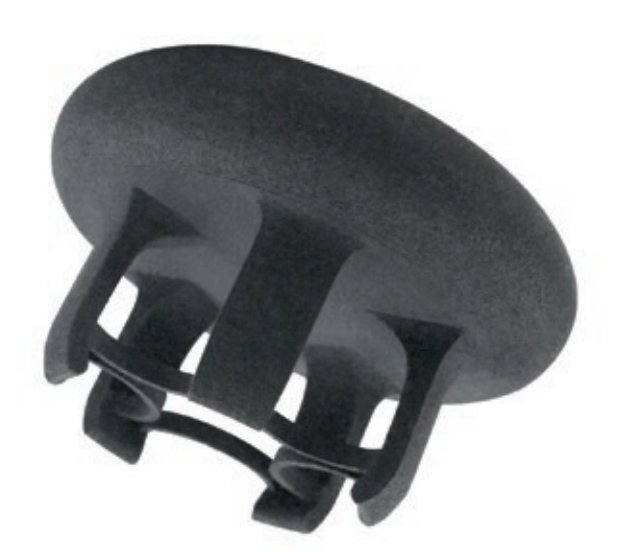
Integrated functions: when compressed air flows into a flexible membrane the claws of the gripper will open; likewise the system closes when the compressed air is turned off (Source: Kuhn-Stoff).

The significance of the weight comes down to physics: grip