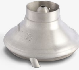
Project Partner Isar Aerospace

EOS NickelAlloy IN718 is a precipitation-hardening nickel-chromium alloy that is characterized by having good tensile, fatigue, creep and rupture strength at temperatures up to 700 °C (1,290 °F).