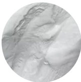
PA 2200 Performance