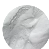
PA 2200 CarbonReduced Performance