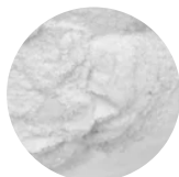
PA 2210 FR