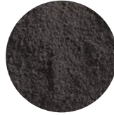
PA 1102 black