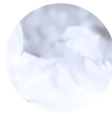
PA 2241 FR