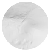
EOS TPU 1301