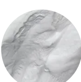
PA 2200 CarbonReduced Performance