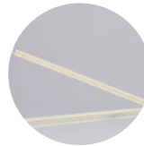
PA 2210 FR