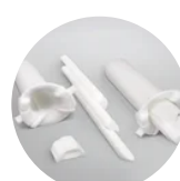
PA 2200 CarbonReduced Performance