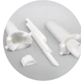
PA 2200 CarbonReduced Balance