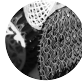
PA 1102 Black