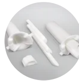
PA 2200 Top Quality