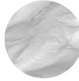
PA 1101 ClimateNeutral