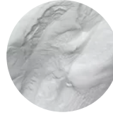
PA 2200 Performance