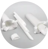
PA 2200 Speed